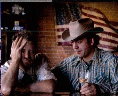
Sugar Britches High Brow Honky Tonk July 23