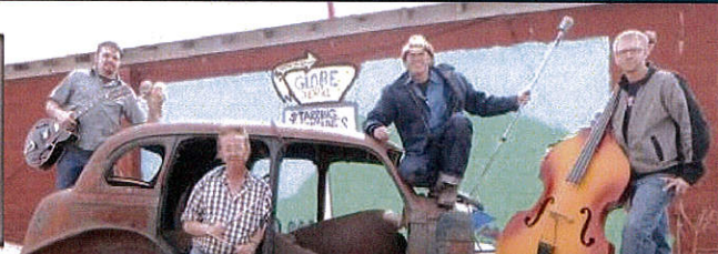
The Atomic Drifters Traditional Rockabilly July 9