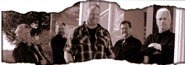
The Long Run Colorado's Tribute to the EAGLES July 2