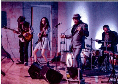
Delta Sonics Chicago & Delta Style Blues July 16