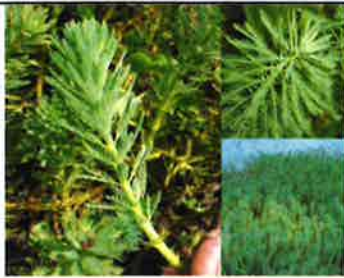
Parrotfeather ( Myriophyllum aquaticum )