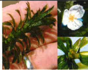
Brazilian Elodea ( Egeria densa )