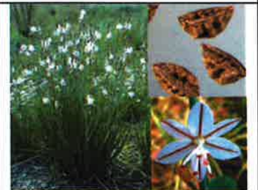
Onionweed ( Asphodelus fistulosus )