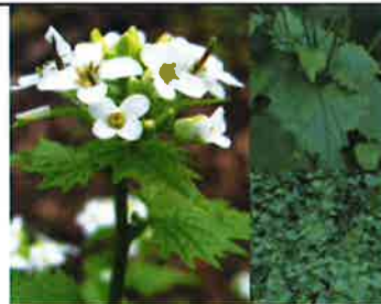
Garlic mustard ( Alliaria petiolata )