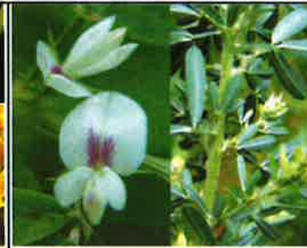
Sericea lespedeza ( Lespedeza cuneata )