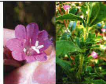
Hairy willow-herb ( Epilobium hirsutum )