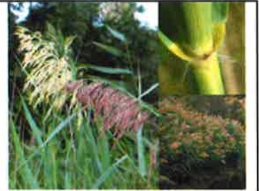
Common reed ( Phragmites australis )