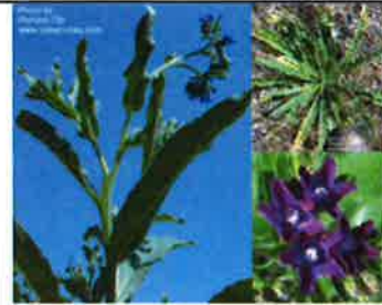
Common bugloss ( Anchusa officinalis )