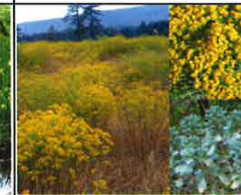
Yellowtuft ( Alyssum murale & A. corsicum )