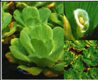
Water lettuce ( Pistia stratiotes )