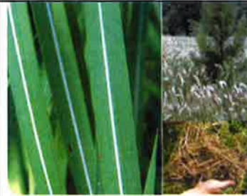
Cogongrass ( Imperata cylindrica )