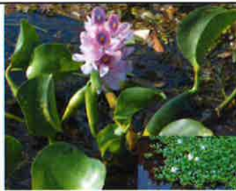
Water hyacinth ( Eichhornia crassipes )