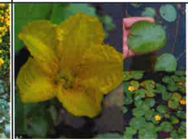
Yellow floatingheart ( Nymphoides peltata )