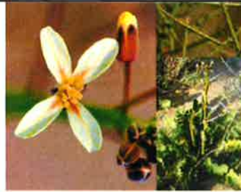
Asian Mustard ( Brassica tournefortii )