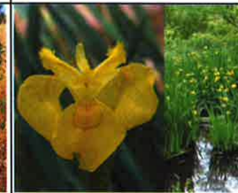
Yellow flag iris ( Iris pseudacorus )