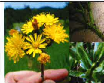
Meadow hawkweed ( Hieracium caespitosum )