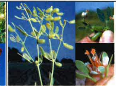
Syrian beancaper ( Zygophyllum fabago )