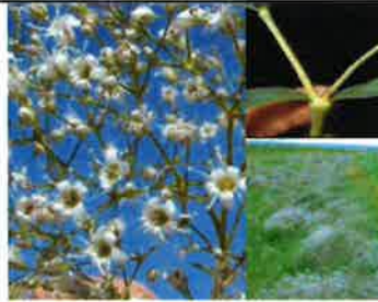
Baby's breath ( Gypsophila paniculata )