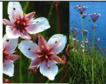
Flowering rush ( Butomus umbellatus )