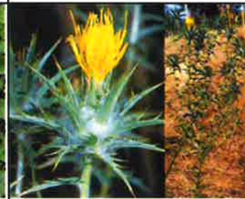
Woolly distaff thistle ( Carthamus lanatus )