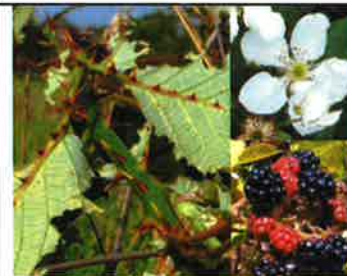
Himalayan blackberry ( Rubus armeniacus )