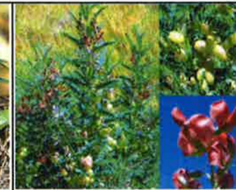
Swainsonpea ( Sphaerophysa salsula )