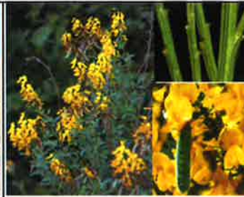
Scotch broom ( Cytisus scoparius )