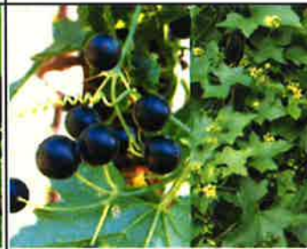
White bryony ( Bryonia alba )