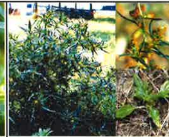
Spiny cocklebur ( Xanthium spinosum )